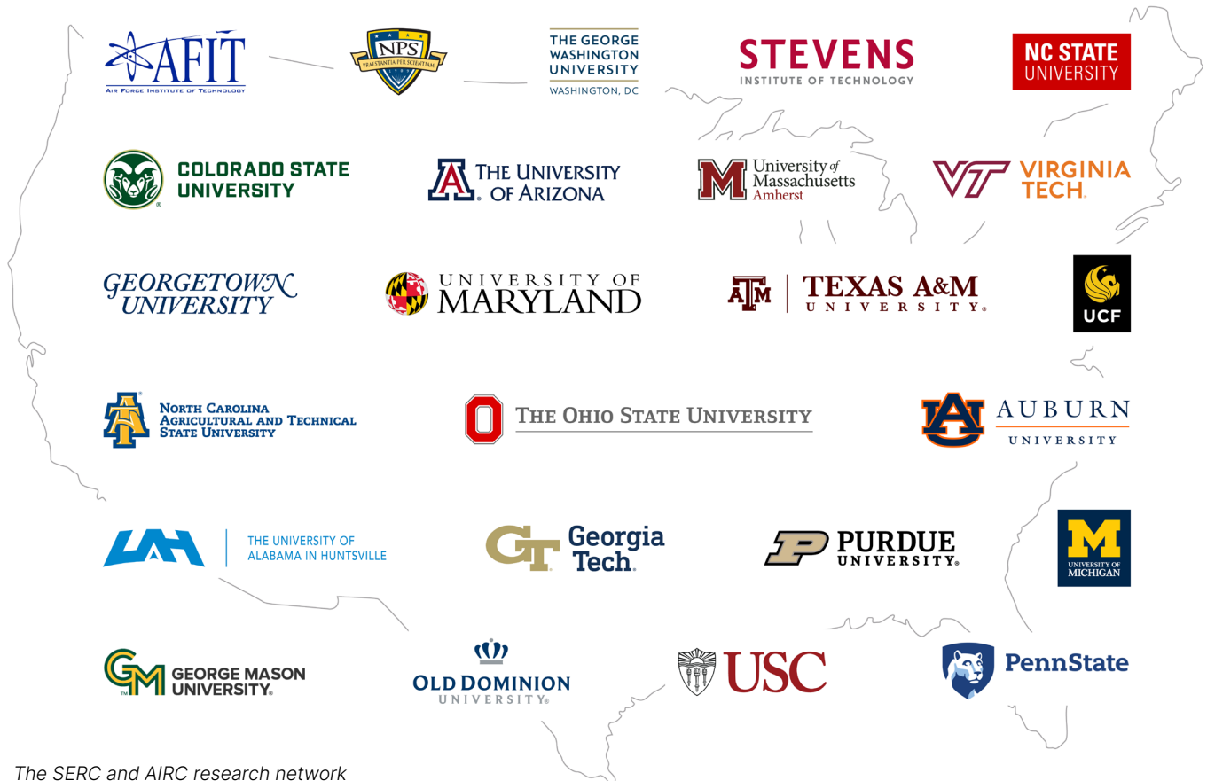
The SERC and AIRC research network

The research projects have been funded by several government organizations including OUSD(A&S), OUSD(R&E), DAU, and others.