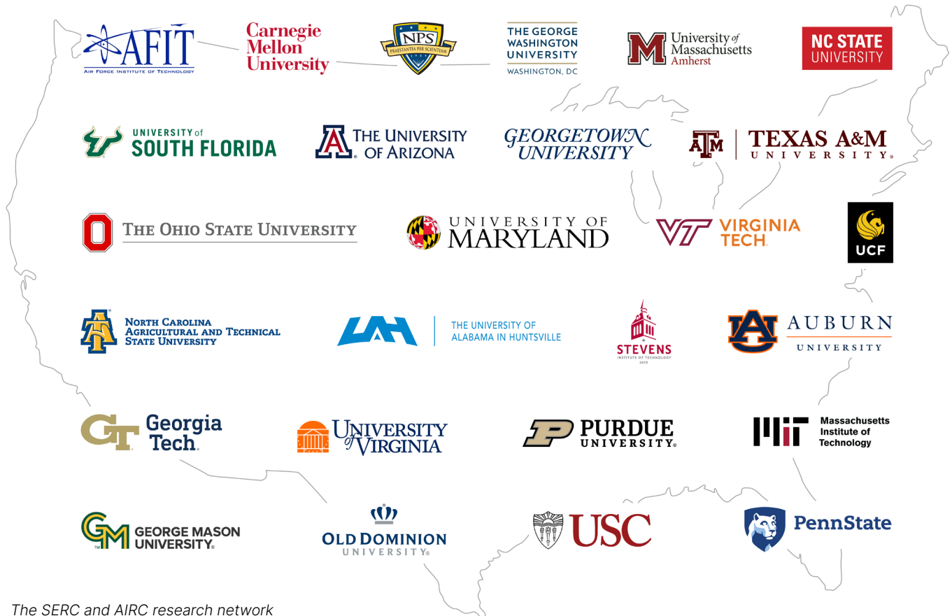
The SERC and AIRC research network

The research projects have been funded by several DoD organizations including OSD(A&S), OSD(R&E), DAU, and others.